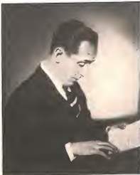
VLADIMIR HOROWITZ Noted Concert Pianist and Recording Artist

Perhaps violinists alone know of the innovations that Pablo Casals has brought to the performance of his instrument. By the introduction of violin fingering and bowing, he has revolutionized the tech- (Continued on Page 341)